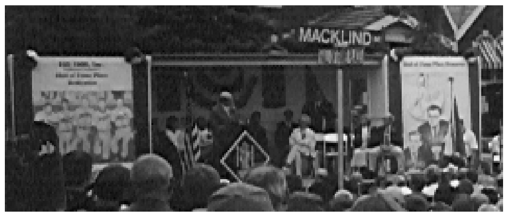
View of ceremony stage & street sign from in front of the ol' Buck home

The plans included inviting Yogi, Joe and members of the Buck family back to the neighborhood for the celebration. When contacted, Christine Buck was excited about coming back to The Hill, and mentioned her ( Continued on page 3 )